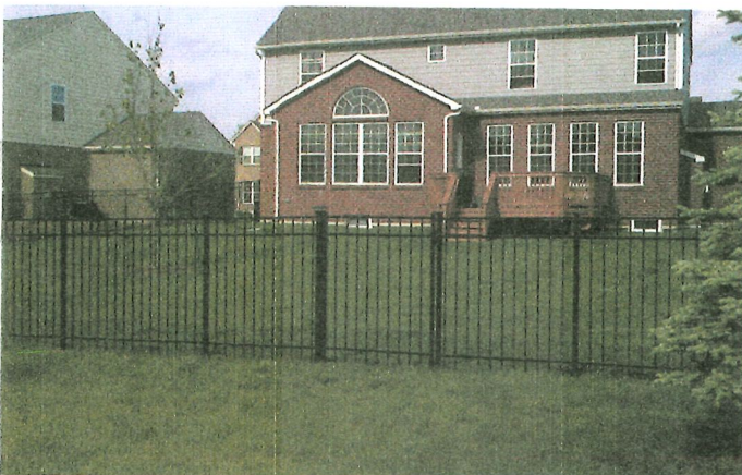
GRANITE HARBOR SERIES IN BLACK