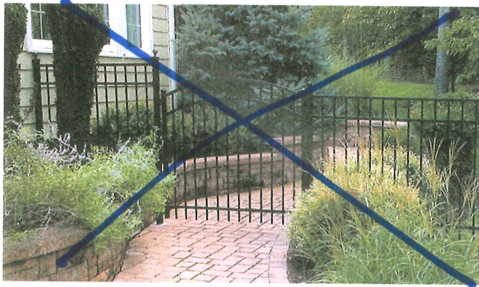
GRANITE HARBOR SERIES IN BLACK