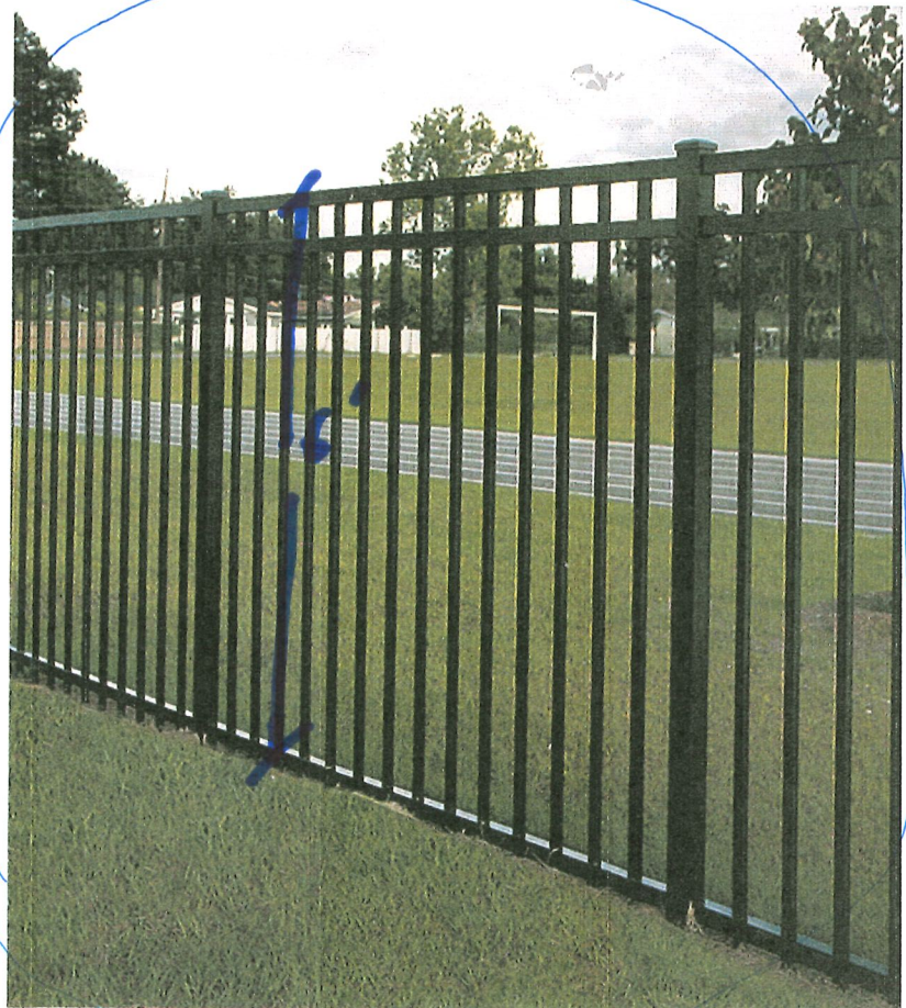
GRANITE HEARTH SERIES IN BLACK