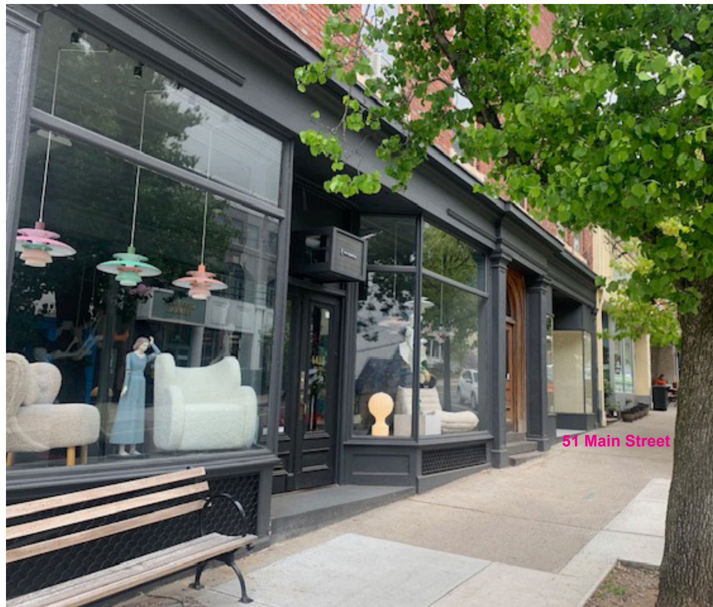
Left of storefront