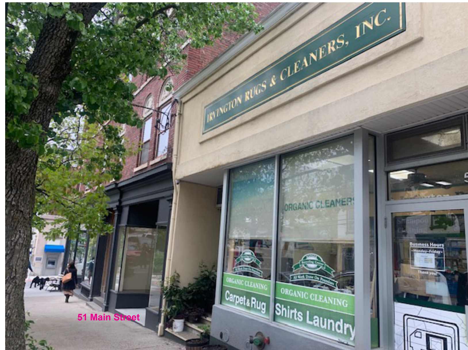
right of storefront