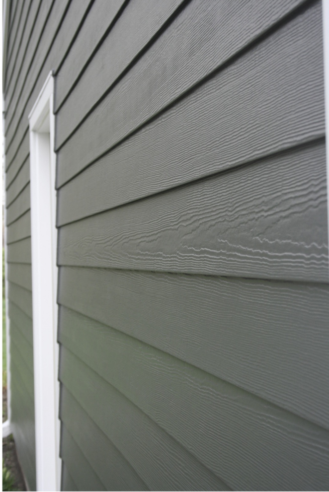
Detail in cedarmill finish (ours will be smooth)